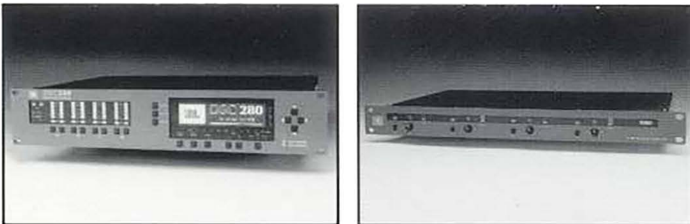
DSC280 Digital Controller and SMC24 Analog Controller